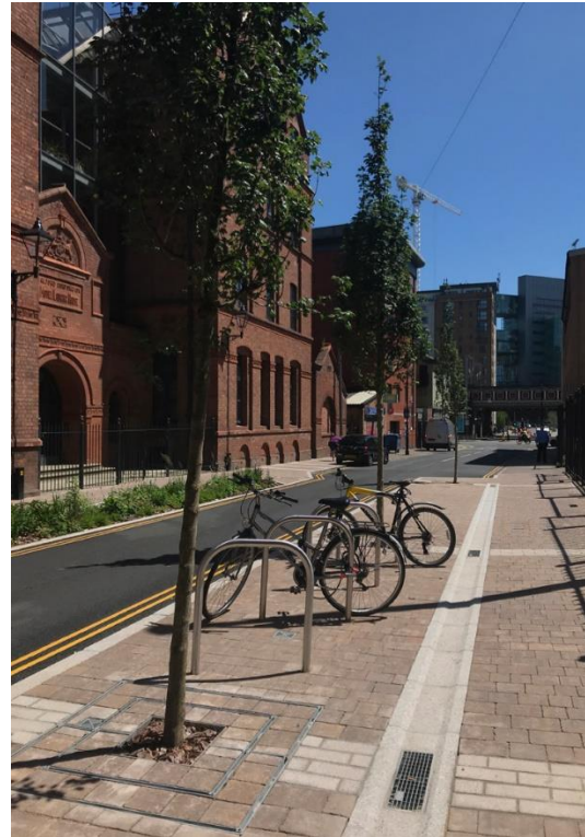
Tree pits - Bloom Street, Salford