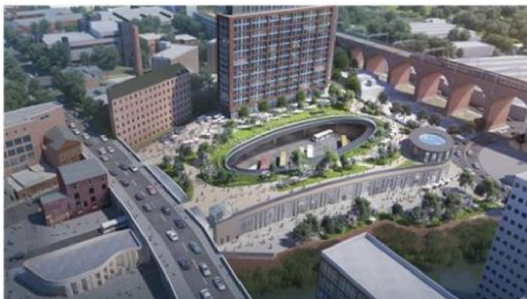
Plan for green roof at Stockport Interchange