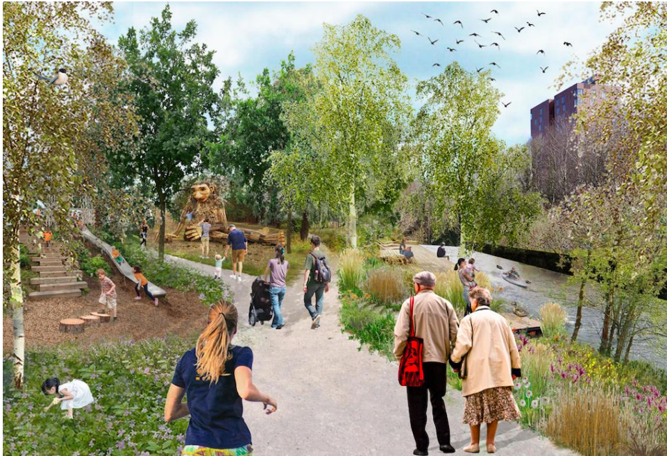
Proposals for River Irk Park – Northern Gateway