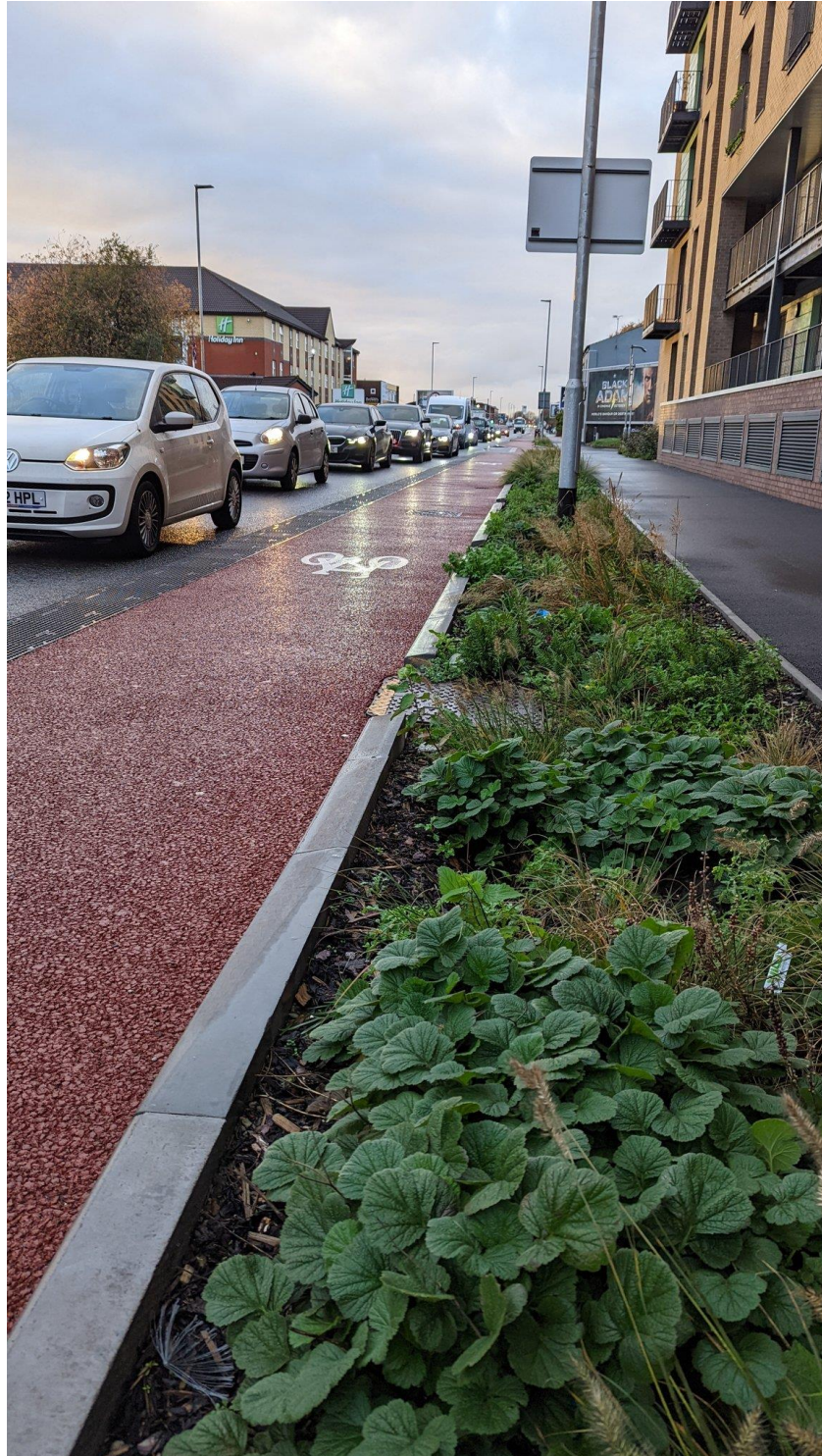
Greater Manchester Combined Authority Overview & Scrutiny Committee February 2023

An investigation into the wider determinants of effective integrated water management in Greater Manchester.