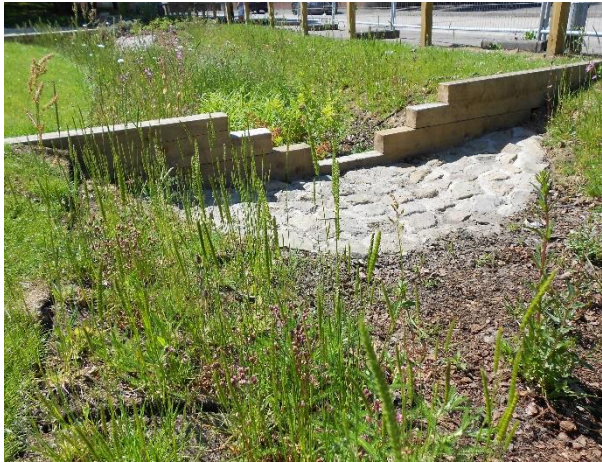
Swales - West Gorton, Manchester, gets a new park that drinks water - GrowGreen (growgreenproject.eu)

boroughs have clay-based soil, which does not effectively aid natural drainage. Swales or tree pits are considered as more effective types of sustainable drainage and should be a preferred approach considered for any part of a new development.